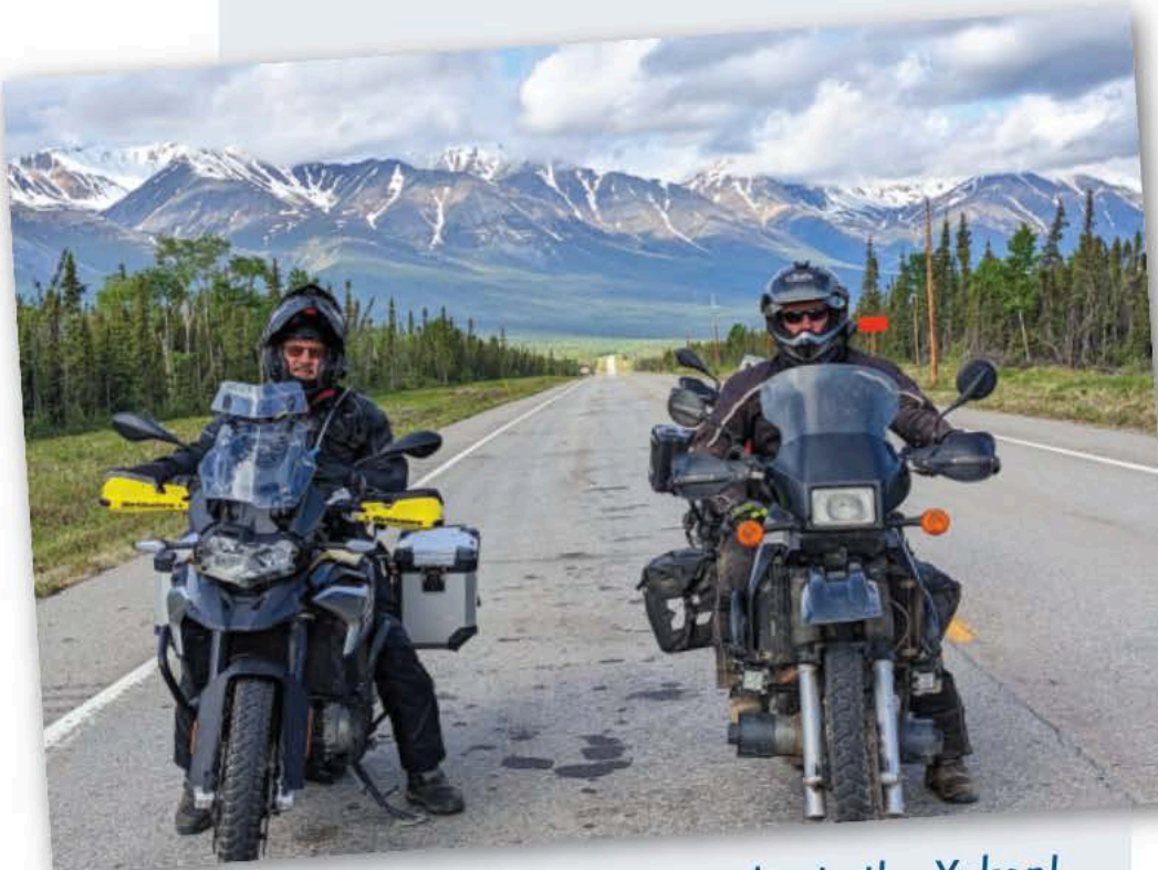
The vistas are spectacular in the Yukon! June, 2023