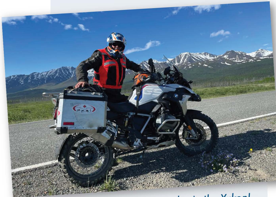
The vistas are spectacular in the Yukon! June, 2023