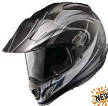
Contrast Black Frost