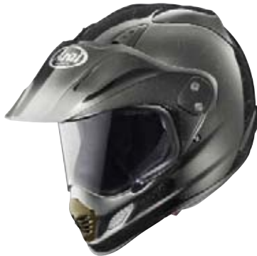
XD Motard Black (fades from black to silver)