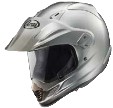
XD Motard Silver (fades from silver to black)