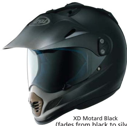
XD Motard Black (fades from black to silver)

The Arai XD looks like a dirt helmet, with its peak, protruding chin bar, and the opening for goggles. But the XD adds a faceshield in the opening that slides up under the peak, unless you choose to remove it, which you can, and use goggles, until you're ready to switch back to the faceshield again.