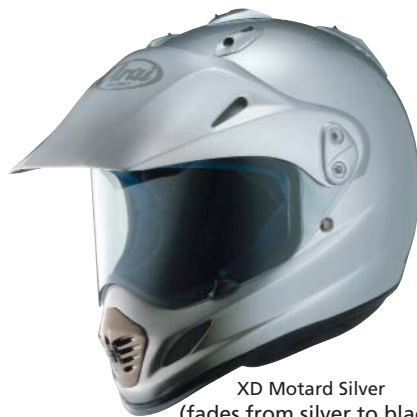
XD Motard Silver (fades from silver to black)